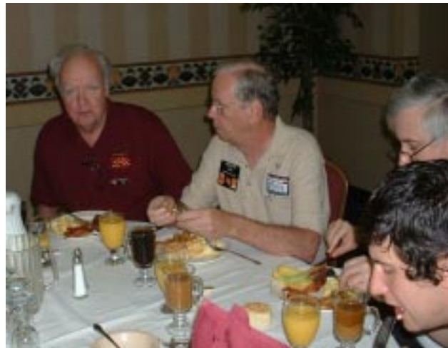
W5PF and N5ET at the Saturday Breakfast