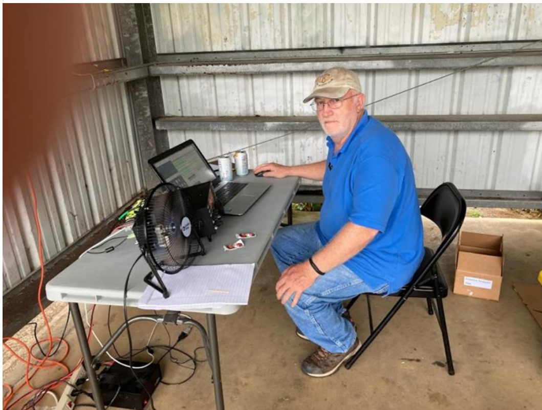
Robie – AJ4F in action!

Comments: This is our 2 nd trip to EL39 and this location. A very convenient place from which to operate. Used two laptop computers, one for WSJT-X and the other for VHF-CHAT on Slack for coordination and PSKReporter for condition monitoring. Internet access was provided by cell phone hot spot with 200 MB of data consumed.