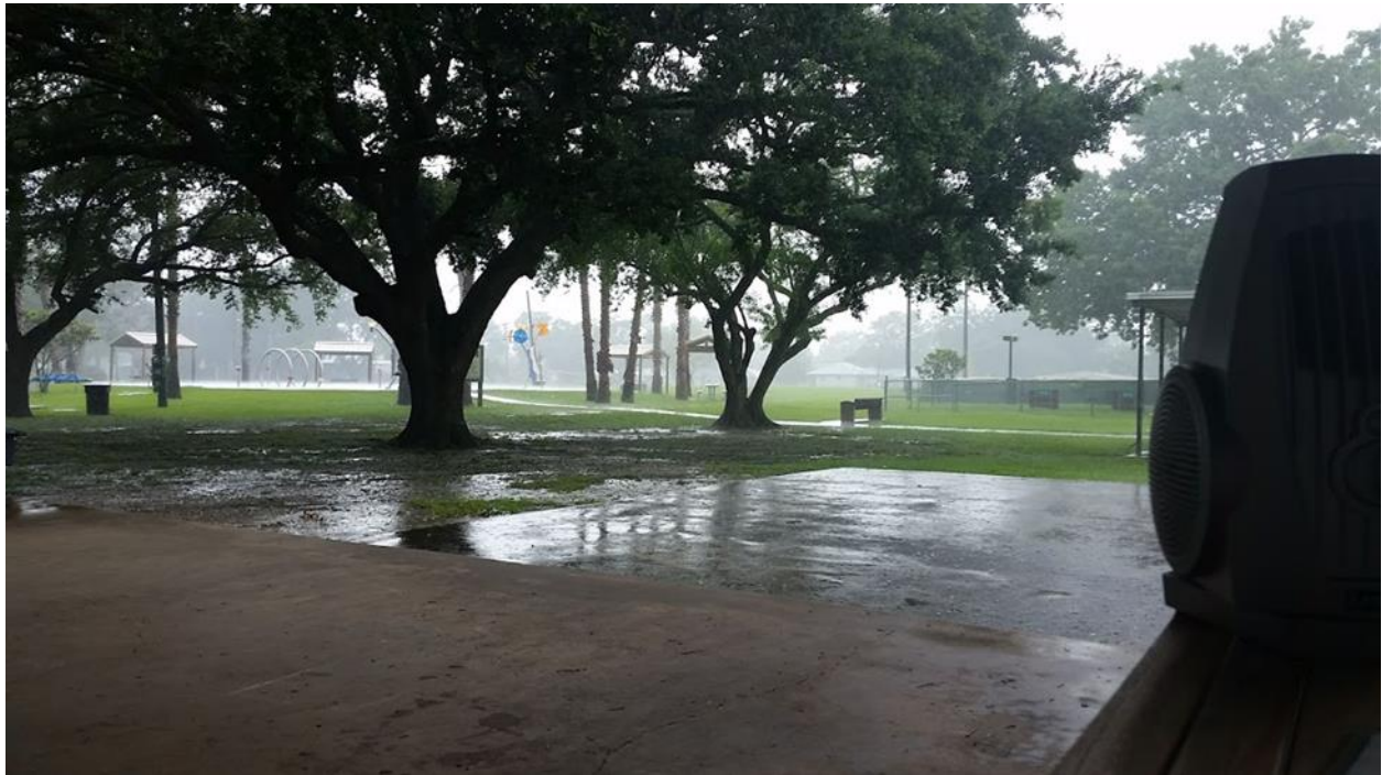
Mother nature's Air Conditioner!